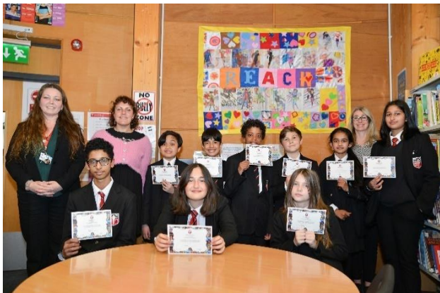
Students proudly displaying their certificates at the unveiling of the art club textile wall hanging.

Over several months, the participants of the Art Club, working with Ms Pinner and Ms Twieg, have created an amazing, large-scale textile hanging, focused around REACH, the school's acronym standing for Respect, Excellence, Achievement, Citizenship and Happiness.